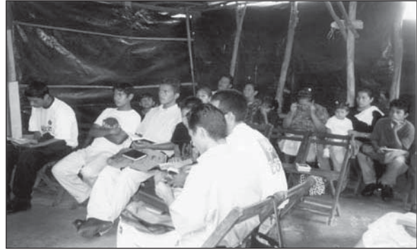
The Congregation in Diriamba-Jinotepe (Pictured above is the church building and some of the congregation.)