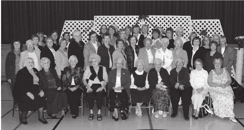
WAVES members at the Partnership Dinner

These groups who have supported the schools embody what Paul calls all Christians to embody in Galatians 6:9-10: "Let us not become weary in doing good, for at the proper time we will reap a harvest if we do not give up. Therefore, as we have opportunity, let us do good to all people, especially to those who belong to the family of believers." Viewing ourselves as partners with fellow believers, we commit ourselves to reciprocate the financial and spiritual support offered to us in