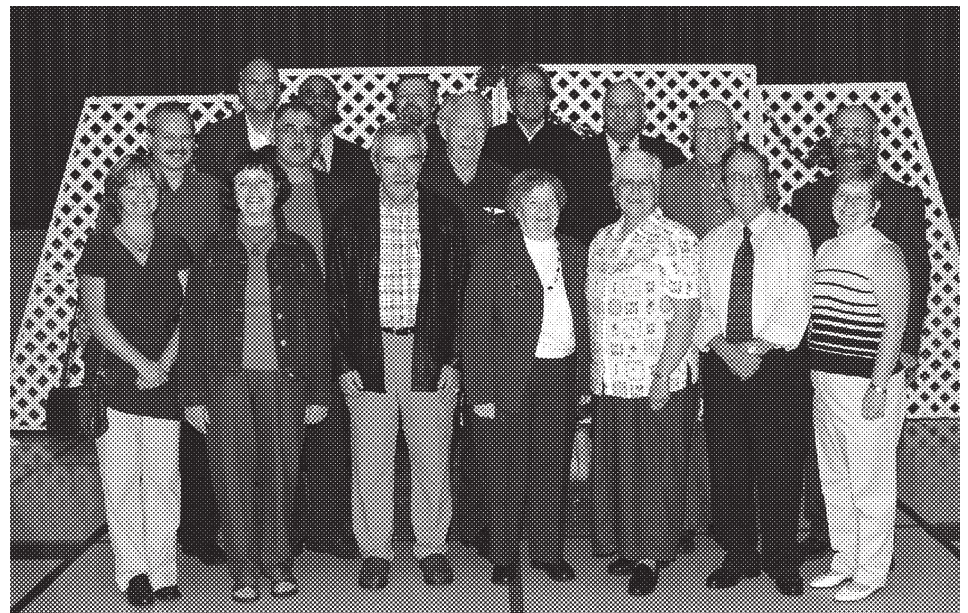
The other group that was honoured at the Partnership Dinner was the congregations who support the Bible College.

financial and spiritual support of the Bible College. Together, all 45 congregations have donated nearly $500 000 over 11 years, most in support of the