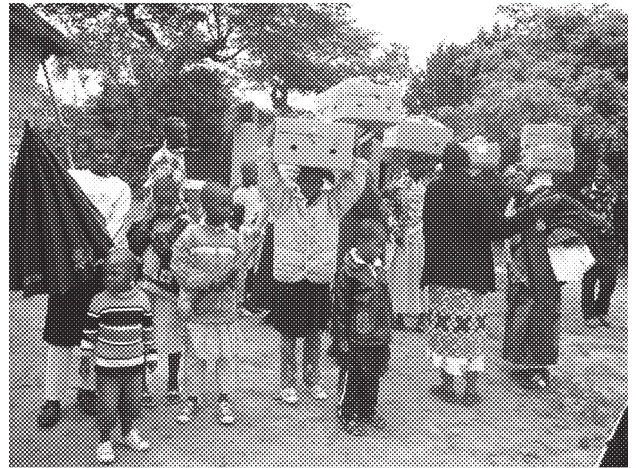
Natives receiving boxes of food and clothing in Zimbabwe

ZIMBABWE: "This is a special year for us in Zimbabwe and all overseas congregations supporting this work. In July, we shall celebrate the 10th anniversary of the World Bible School in Zimbabwe. The work that has been accomplished