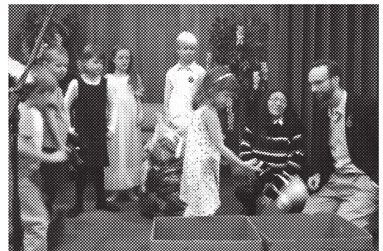
Kids giving gloves in Weyburn