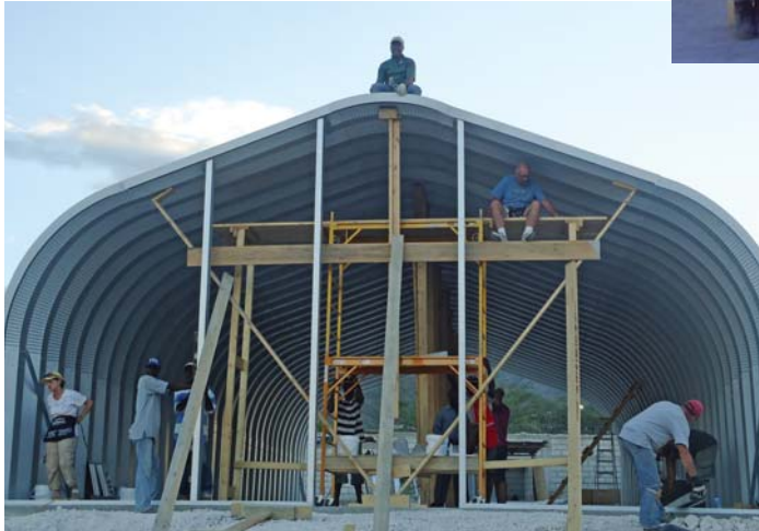
Orphanage building looking good