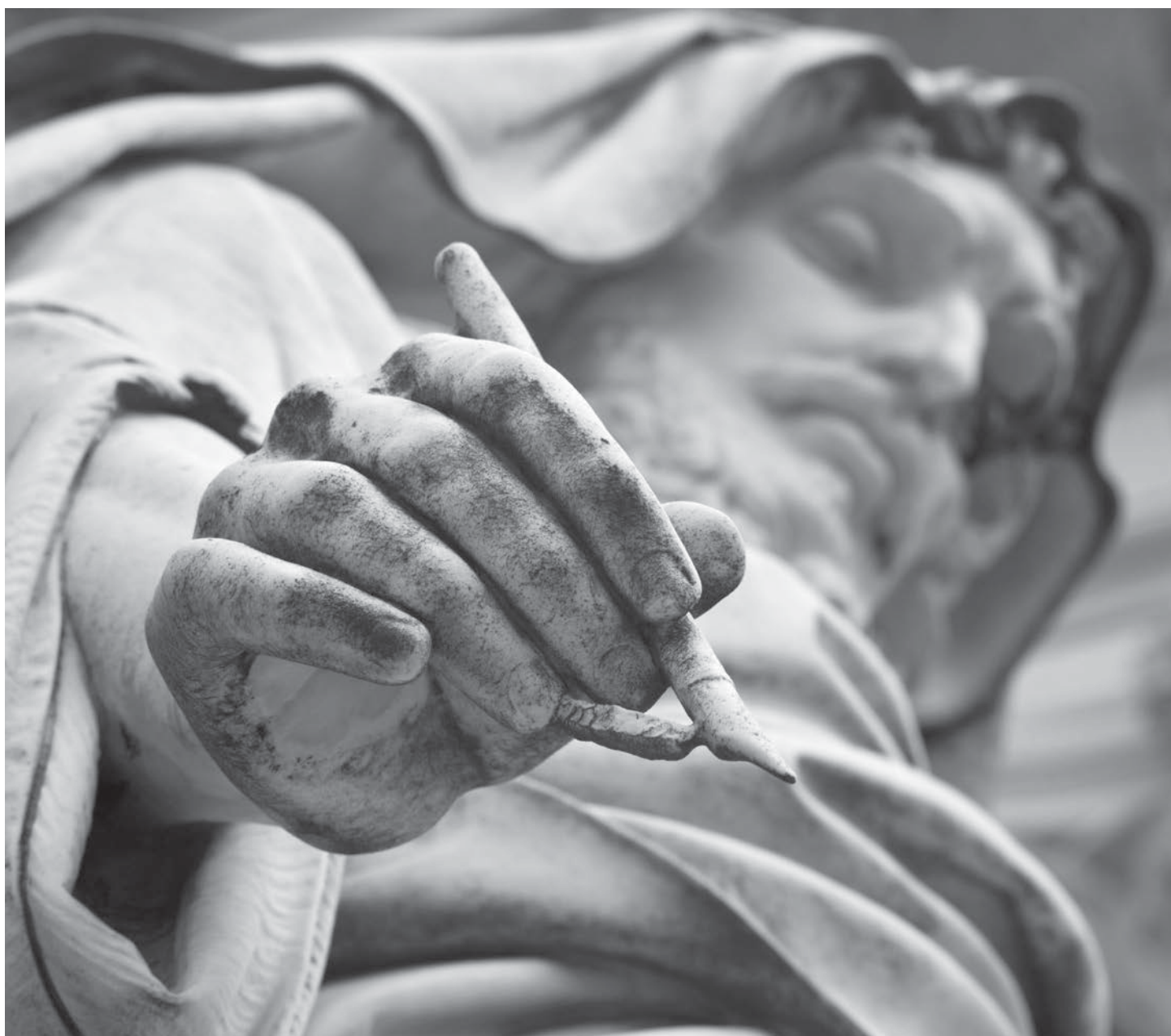
Statue depicting the Apostle John in the atrium of St. Paul's Basilica, in Rome, Italy.