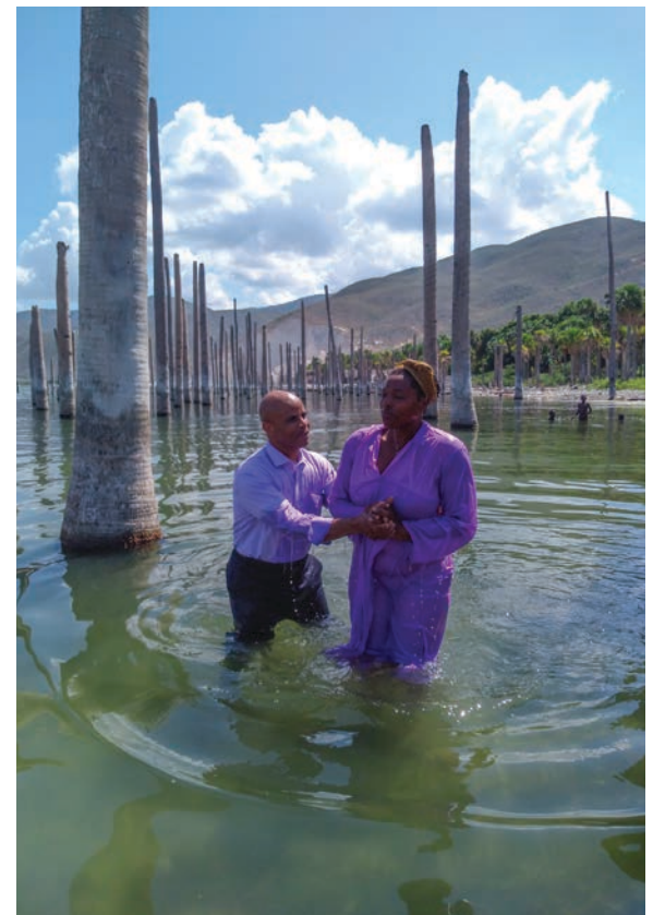
Our newest sister