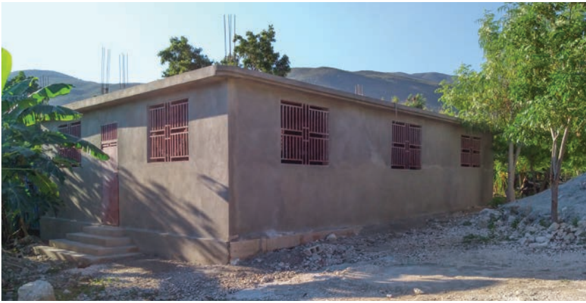
The new small building with 6 classrooms