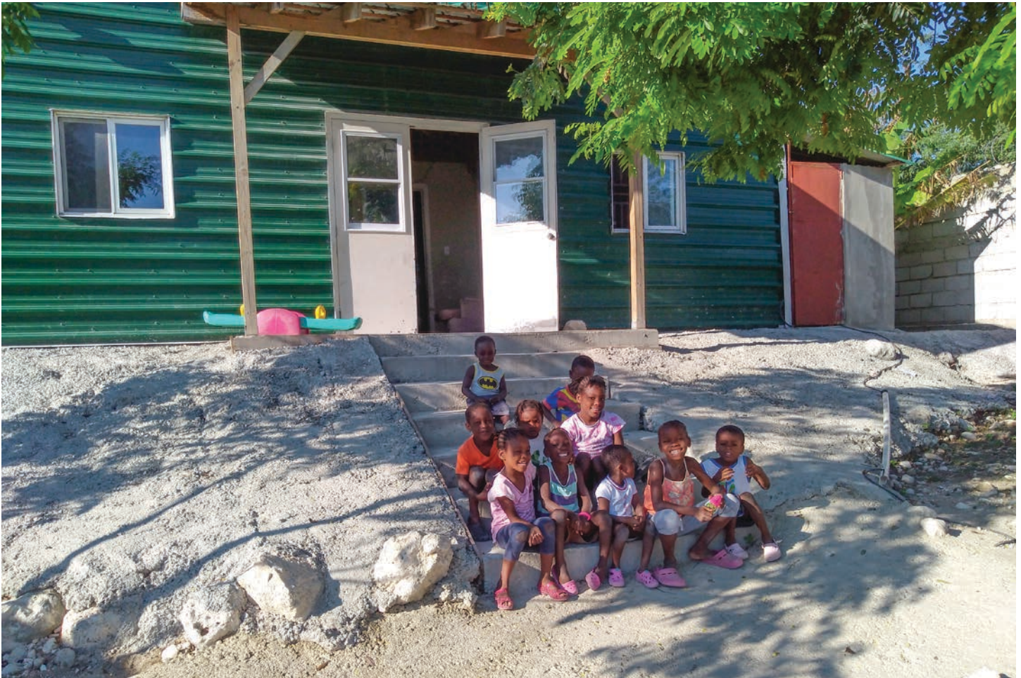
Some of our kids in front of the orphanage building